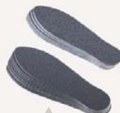
Pedi-Paddle Replacement Patches 6.5" (20) - 160 & 180 Grit