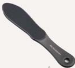
Pedi-Paddle Handle - 160/180 Grit

Bio Sculpture® Pedi Paddle Handle is used as a sanitary handle for Disposable Replacements Patches. Double-sided with 160 Grit Patch & 180 Grit patch. Bio Sculpture® Pedi Paddle Disposable Replacement patches comes in a pack of 20 to use with the Pedi-Paddle Handle. Comes with ten 160 Grit patches and ten 180 Grit patches. Use to buff dry skin during a pedicure before applying Heel Balm, Mint Mask, and Hand and Body Butter.